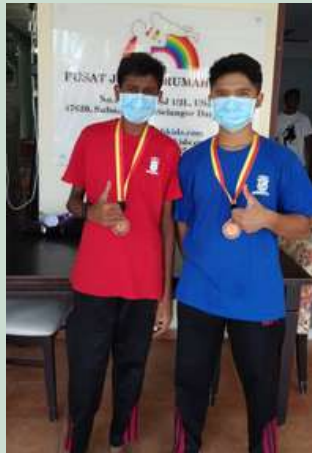
Children won the "Merentas Desa" competition