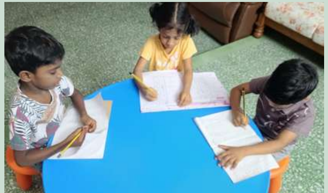
Children are practicing their writing in the toddler's home