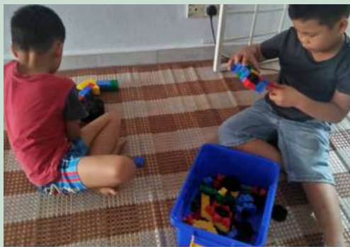
Being creative with Lego