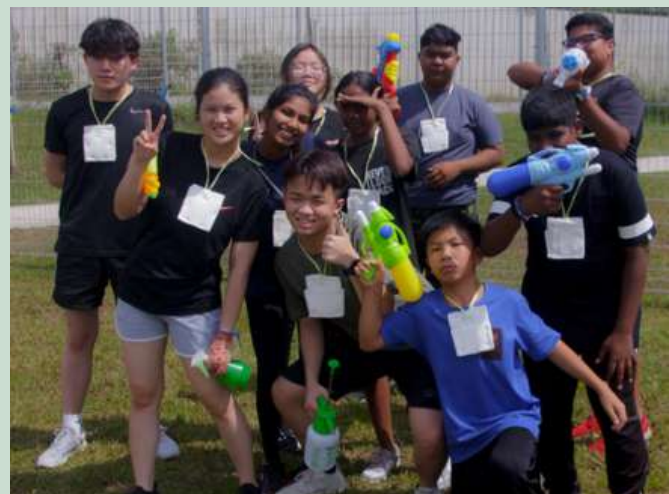
Hydro war game - A lot of fun

I learned about teamwork, time management and mental health. I loved the hydro water game and the ice-breaking game. It was so much fun. I made a lot of new friends