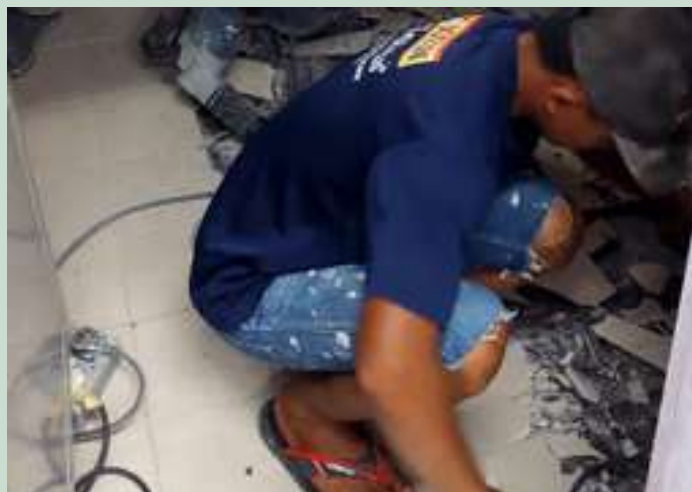
Toilet leaking problem being rectified