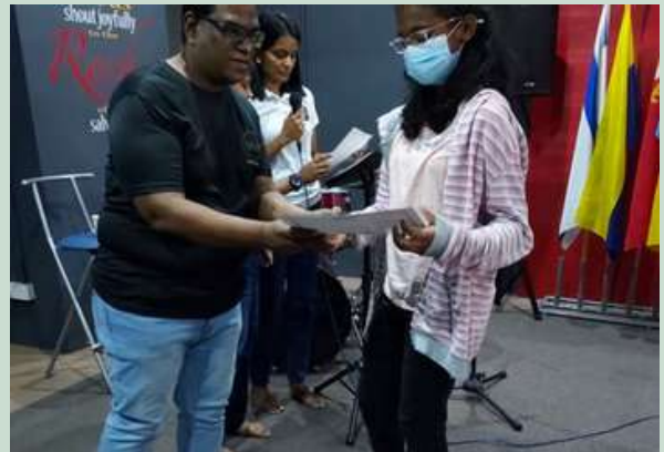
Certificates were given to all participants.