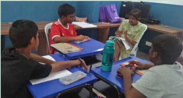
Boys are having tuition. We hired a private tutor to teach the primary boys in the USJ Home.

Education is a priority for Rumah KIDS. We try our best to provide the children for all their academic needs.