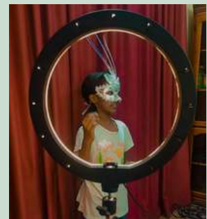
Practicing for story telling competition