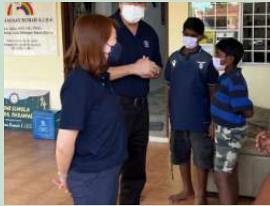
Nestle Malaysia blessed us with a cash contribution and a year's worth of Nestle food products.