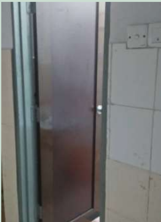
New aluminium door installed