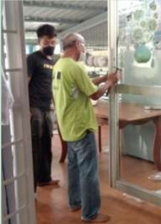
Broken glass door being replaced