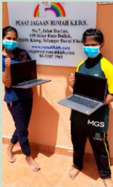
Chrome Book by Luno Malaysia