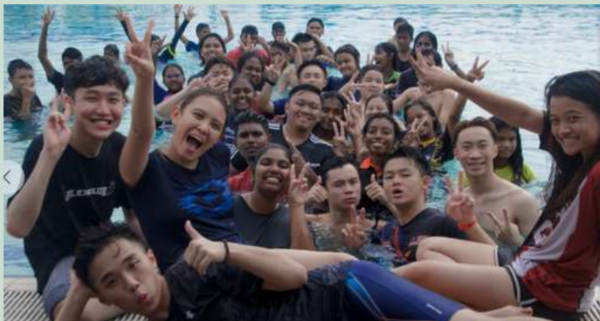
Free and easy