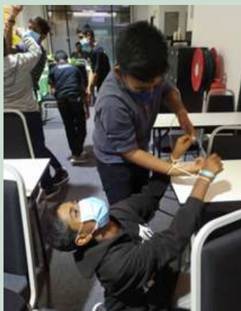
Boys and girls aged 12 years old and above attended this course.

No Apologies is a character-based sexuality curriculum that empowers young people to make wise choices regarding high-risk behaviors eg. premarital sex etc.