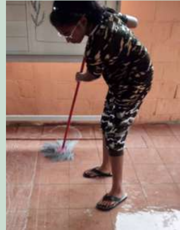
House cleaning time