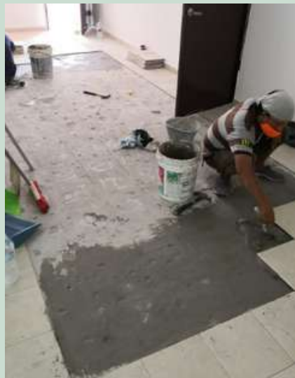
Tiling job done in the wet kitchen area.