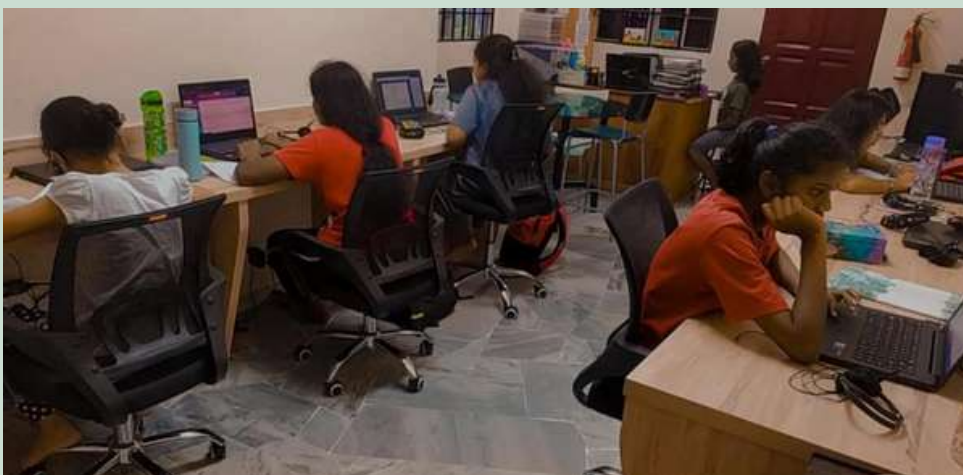
Study time at the girl's home